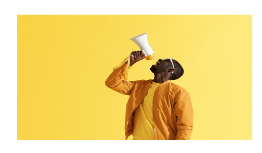
There's Always A Response

<u>Psalms 31:24</u> "Be of good courage, and He shall strengthen your heart, all ye that hope in the Lord."