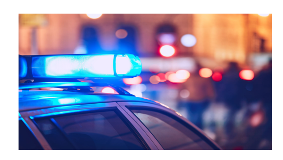
Fulfilling The Law Of Christ

Galatians 6:2 says: "Bear ye one another's burdens, and so fulfil the law of Christ."