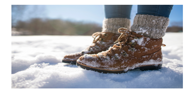
Why There Should Never Be Backsliders

Proverbs 14:14 (KJV) 14 The backslider in heart shall be filled with his own ways: and a good man shall be satisfied from himself.